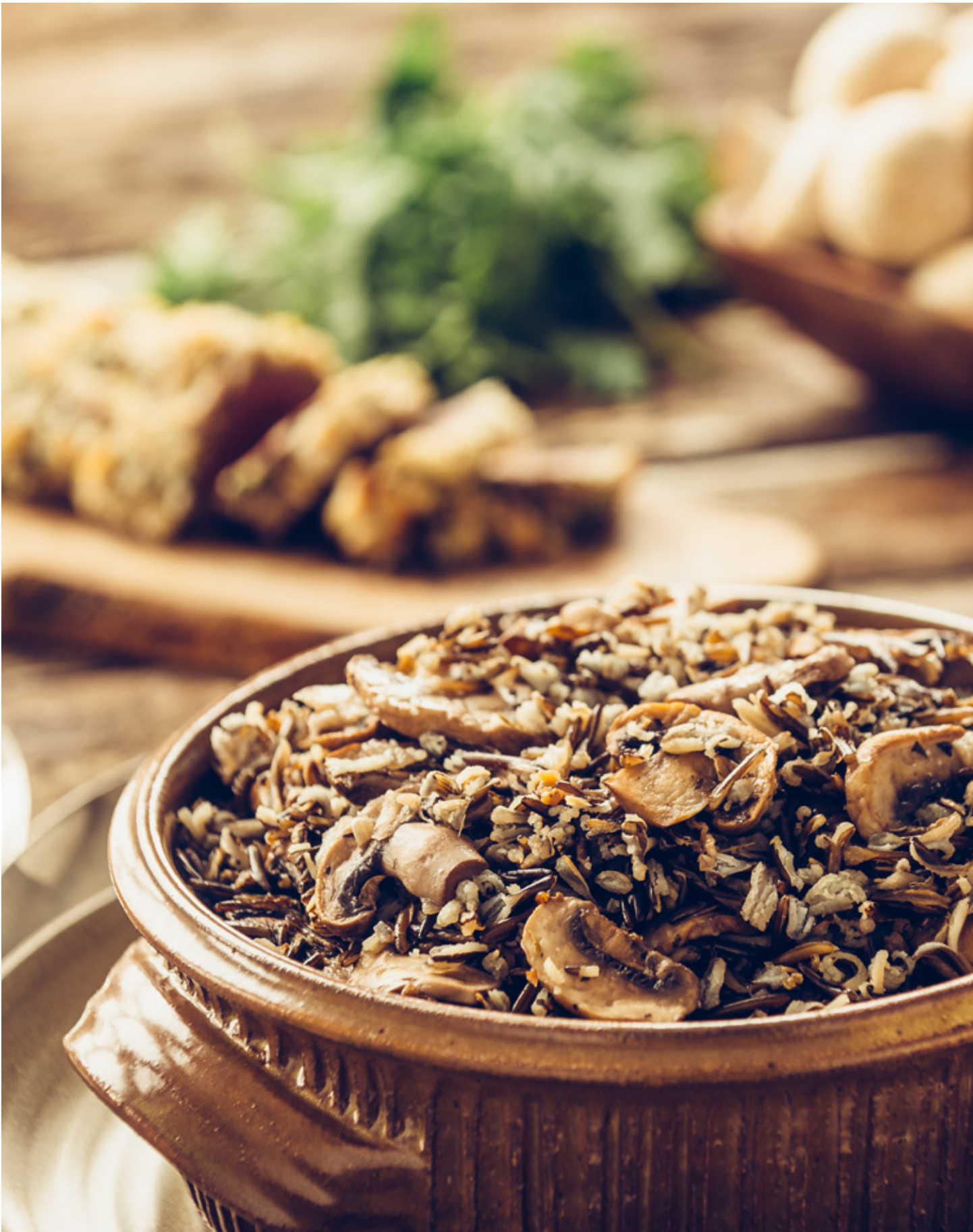
MARIE'S WILD RICE CASSEROLE SUPREME