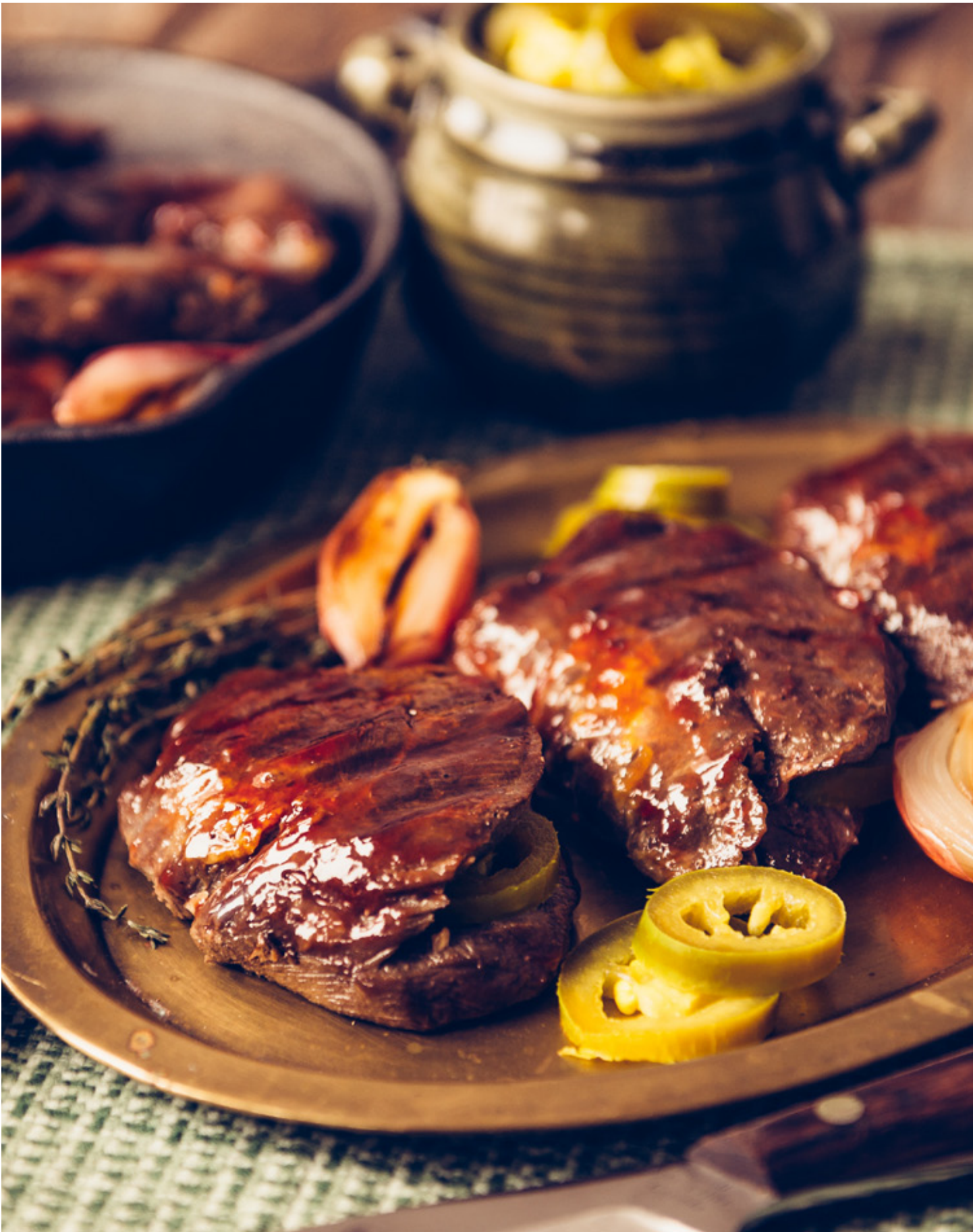
JALAPEÑO GOOSE BREASTS SUPREME