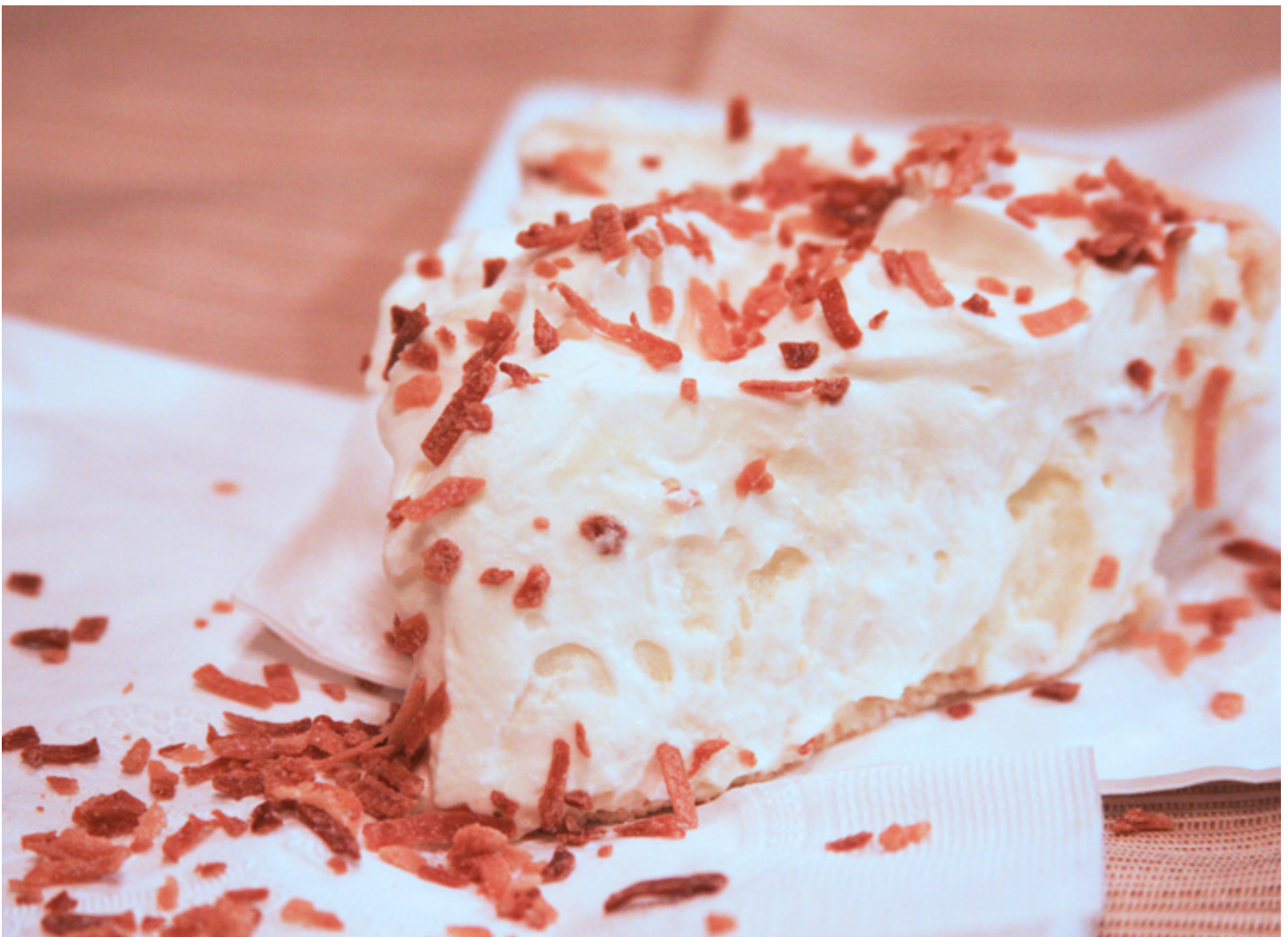
COCONUT CREME PIE

*Since we are using whole eggs, the white may tend to cook in lumps. Just mix it with a hand blender until smooth. The flavor and texture will be lovely!