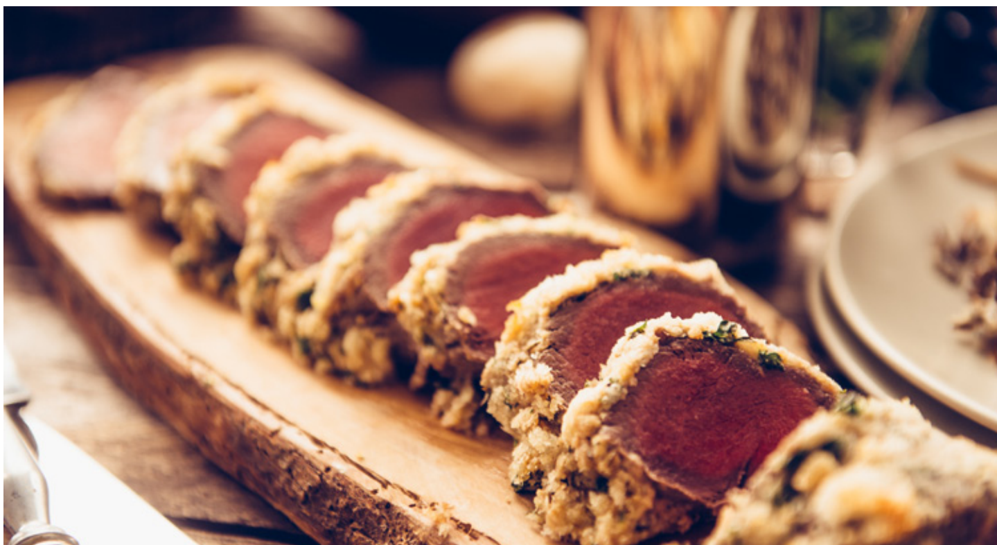
CRUSTED CARIBOU TENDERLOIN WITH MUSHROOM AND RED WINE REDUCTION

*See page 8 for a note on how to substitute for DLS (Dymond Lake Seasoning)