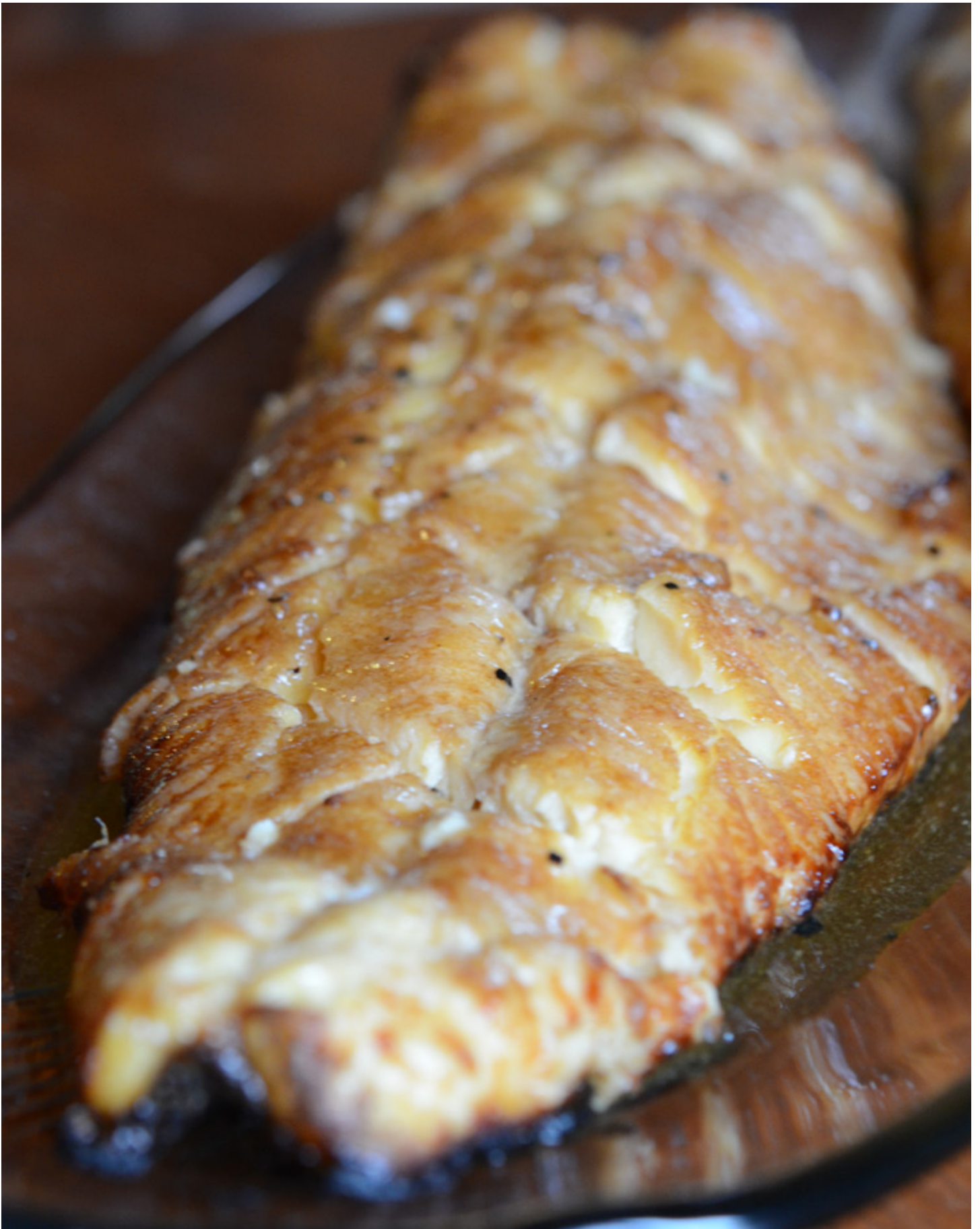
SOUSED SALMON OR TROUT BARBECUE