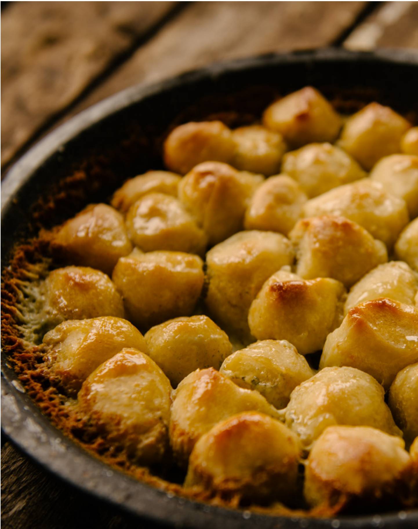
BLUE CHEESE COUNTRY BUNS