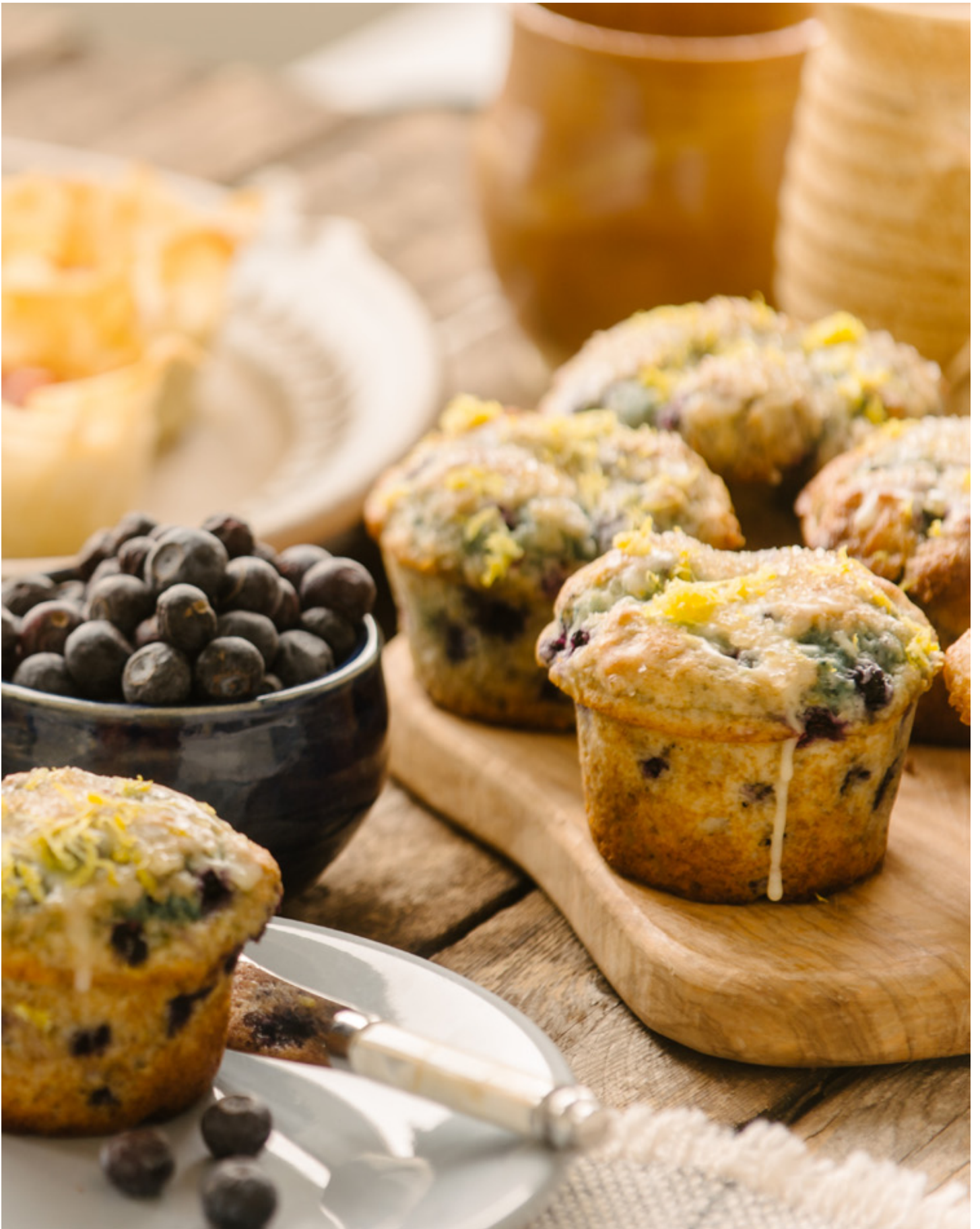
SUNSHINE BLUEBERRY MUFFINS