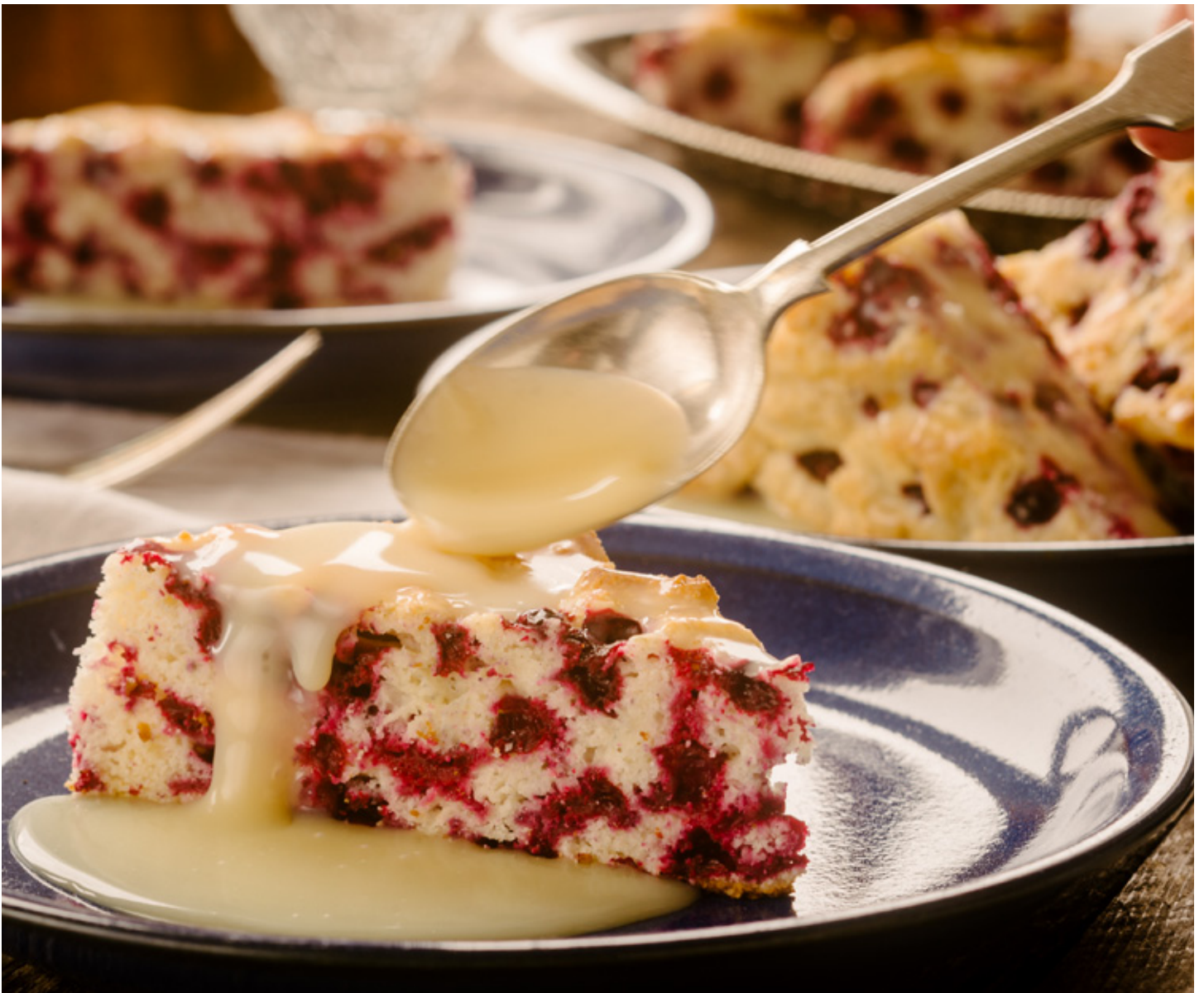
CRANBERRY CAKE WITH BUTTER SAUCE

If you want to make this in a 9" (23 cm) square pan, just cut back on the ingredients by 1/3.