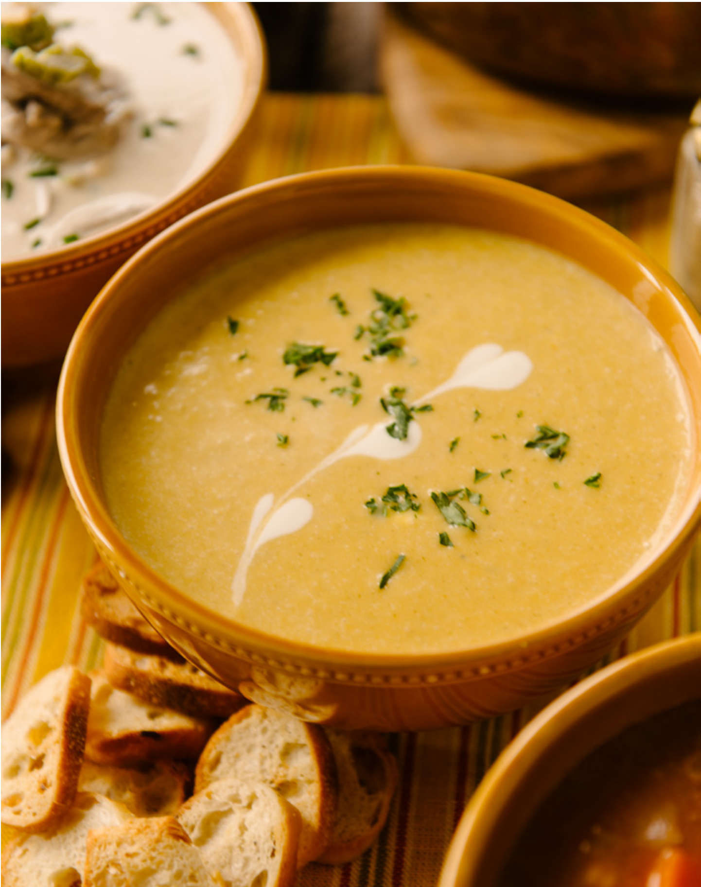
CURRIED SQUASH SOUP