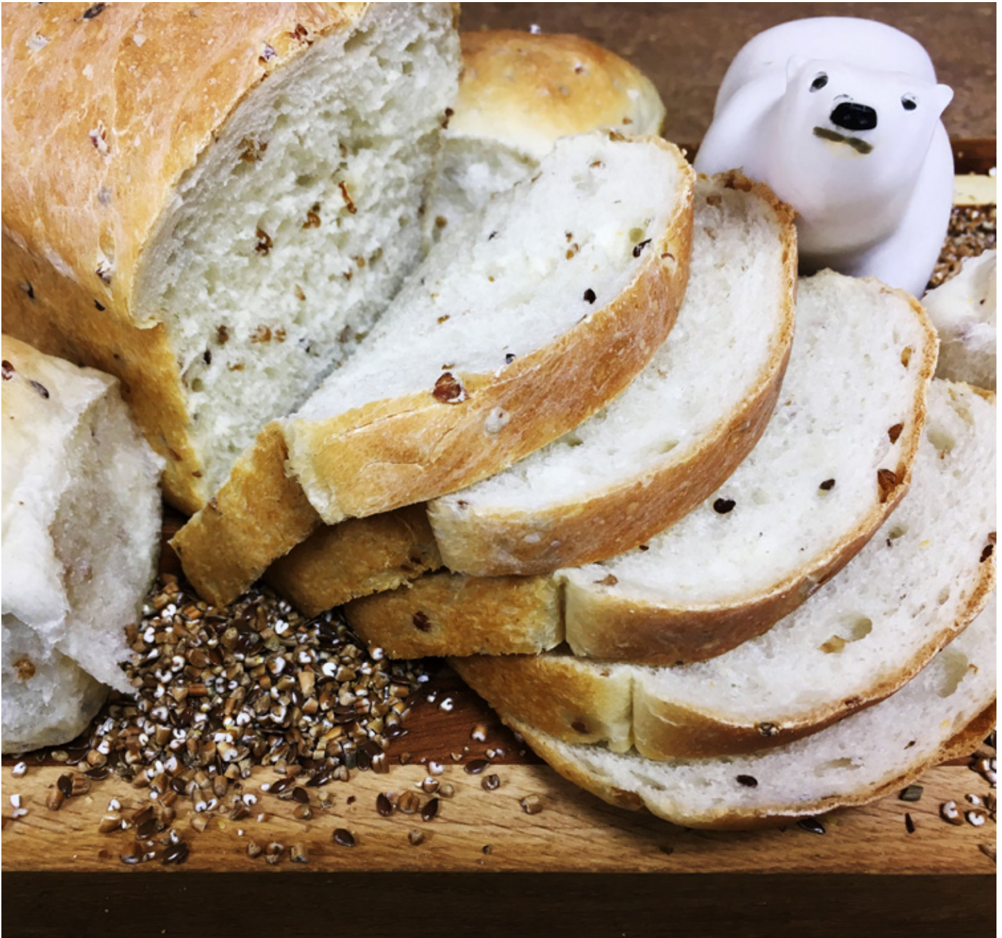
RED RIVER BREAD

**If making Red River Cereal from scratch, use 1 cup (250 mL) dry cereal, boiled in 3 cups (750 mL) of water. It makes more than 2 cups (500 mL), but you can use it all in this recipe.