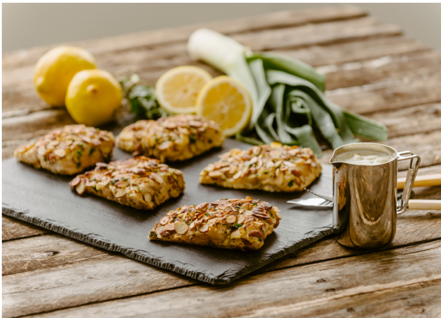
ALMOND-CRUSTED TROUT WITH LEEK AND LEMON CREAM

**Pour boiling water over onions – let sit for 5 minutes, drain and use as above.