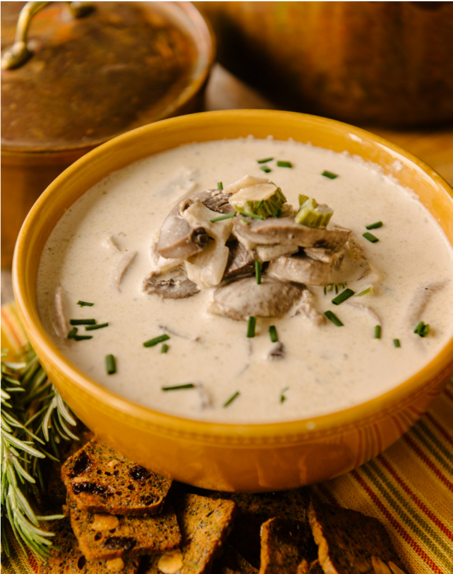
SIMPLY DELICIOUS MUSHROOM SOUP