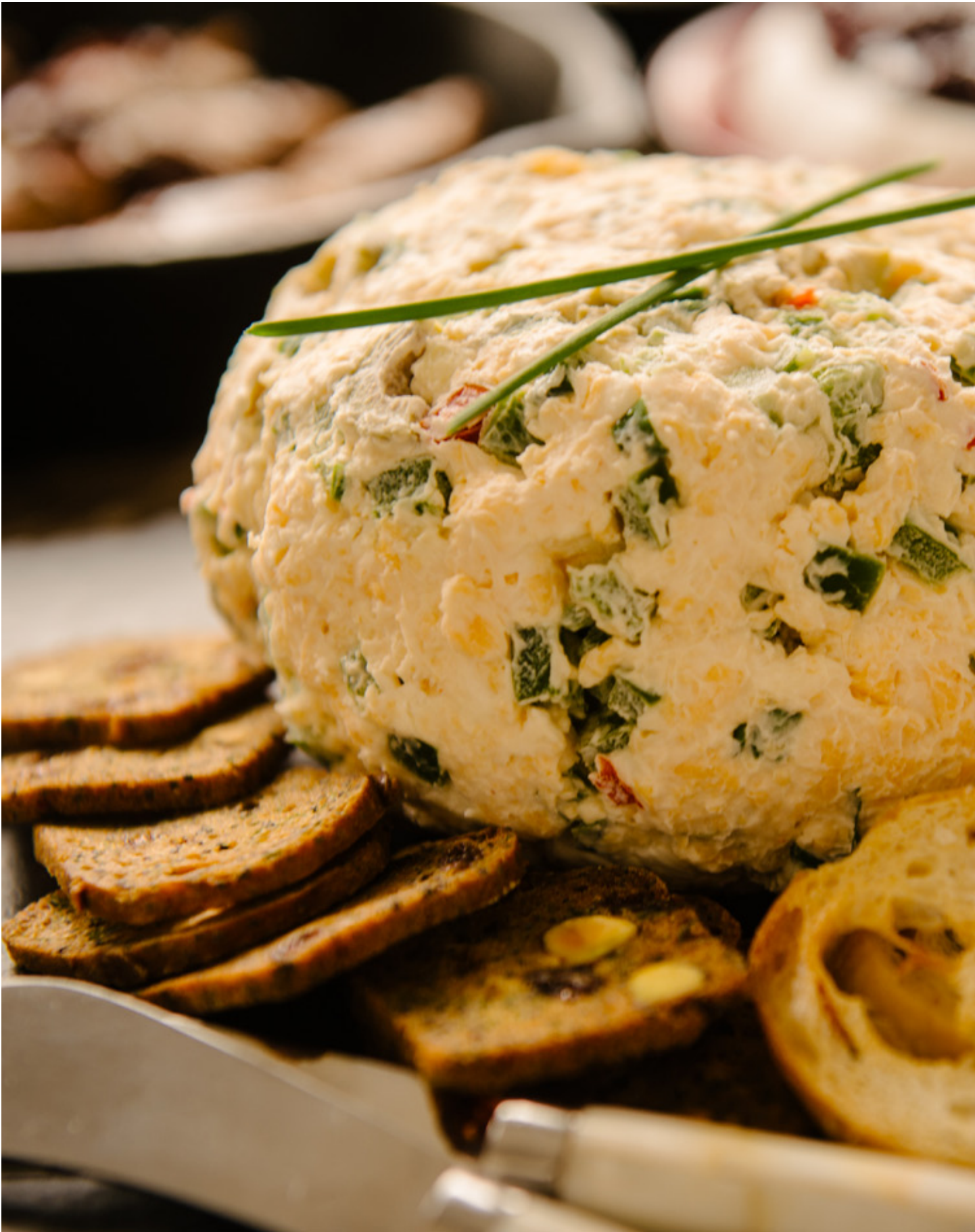
OLIVE LOVER'S CHEESE BALL