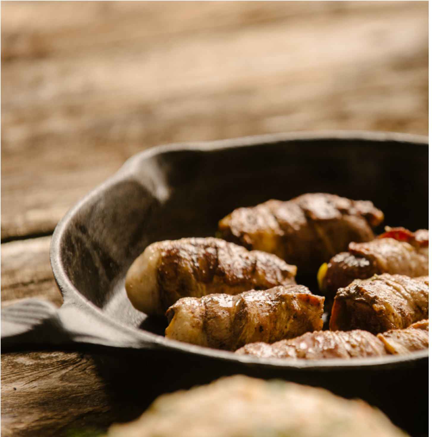
CARIBOU BACON WRAPS