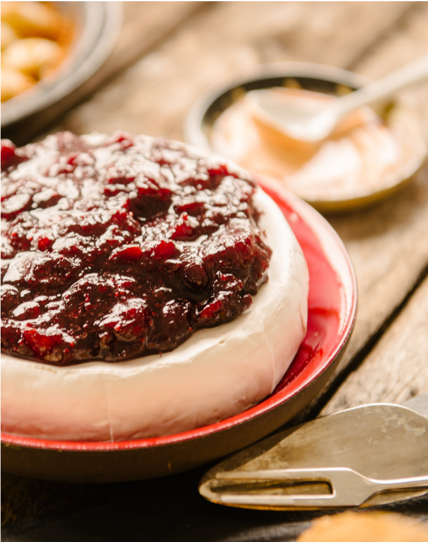
BAKED BRIE WITH CRANBERRY CHUTNEY