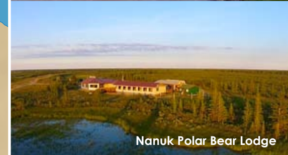
Nanuk Polar Bear Lodge