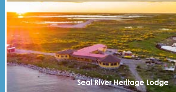
Seal River Heritage Lodge