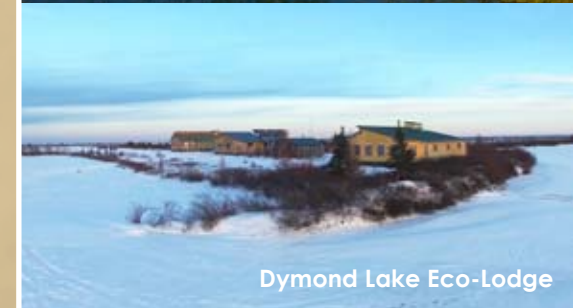
Dymond Lake Eco-Lodge