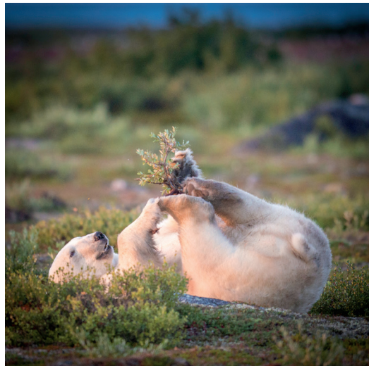
Polar bears are playful and enjoy yoga