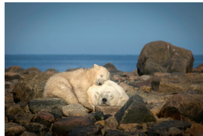
A yearling cub sleeps with his mother after a long swim in the ocean