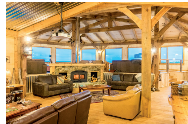
The cozy lounge at Churchill Wild's Seal River Heritage Lodge