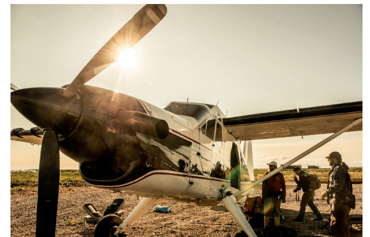
Travel in the Arctic is by bush plane