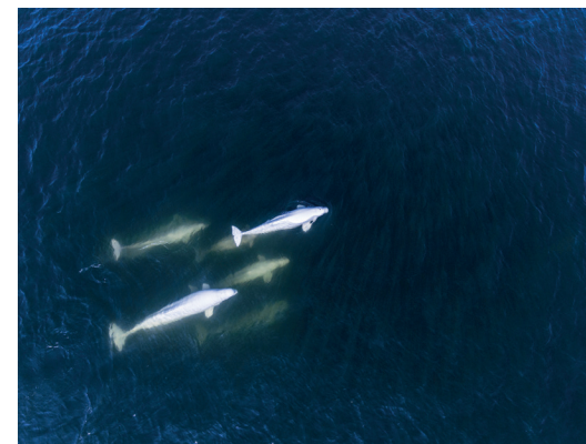
Zodiacs bring guests out to snorkel with curious beluga whales

Follow Jad on Instagram and Facebook: @jaddavenport