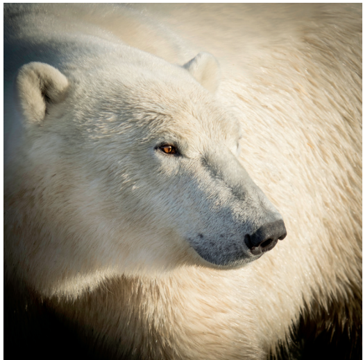
At almost 13-feet tall, an adult polar bear is the largest land carnivore, it can look down through a basketball hoop