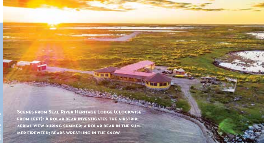
SCENES FROM SEAL RIVER HERITAGE LODGE (CLOCKWISE FROM LEFT): A POLAR BEAR INVESTIGATES THE AIRSTRIP; AERIAL VIEW DURING SUMMER; A POLAR BEAR IN THE SUMMER FIREWEED; BEARS WRESTLING IN THE SNOW.