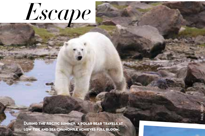
DURING THE ARCTIC SUMMER, A POLAR BEAR TRAVELS AT LOW TIDE AND SEA CHAMOMILE ACHIEVES FULL BLOOM.