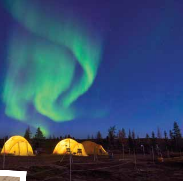
SLEEPING UNDER THE NORTHERN LIGHTS AT CHURCHILL WILD'S SATELLITE ARCTIC SAFARI TUNDRA CAMP. LEFT AND BELOW: THE LOUNGE AND A GUEST ROOM AT SEAL RIVER HERITAGE LODGE. BELOW RIGHT: PHYLLO EGGS AND SUNSHINE MUFFINS AT NANUK POLAR BEAR LODGE.

sight, the lodges overlook 360 degrees of Arctic splendor. Resident polar bears are often so curious and brazen in their natural environment, visitors don't even need to walk hours in search of them—they come directly to you.