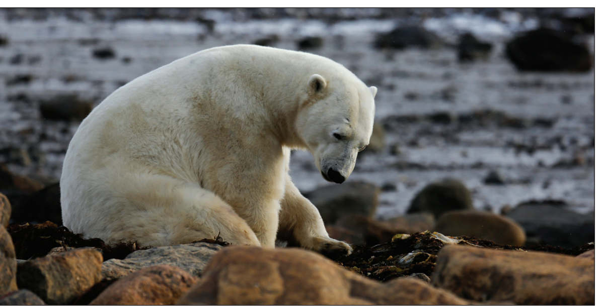
SPEEDY: Polar bears can run at speeds as fast as 25mph

heavy shoreline, maybe even the Lightning Bolt would not escape.